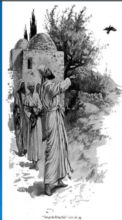
"Let go the bring him."—Lev. xiv. 33.